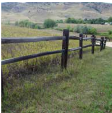
Old Road Reinterpretation of traditional fencing, focusing on simple design of openings, fixings and positioning