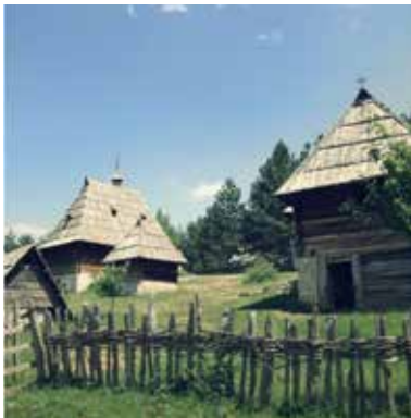
Old Wooden House Restoration (Sekulici) Repairing, revitalizing or reinterpreting traditional timber dwellings