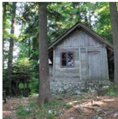
Biljeska Rock Viewpoint (Predov Krst) Repair or replace existing furniture (benches, tables, fences, cottages) at the filming location of 'Some Birds Can't Fly' (1997)