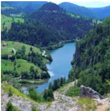
Wood and Water (Zaovine) An intervention on the wild and wonderful shores of Lake Zaovine