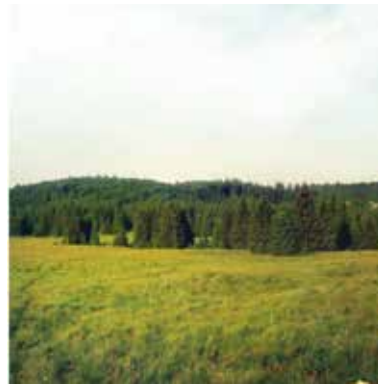
Forest Clearing Create feeding points or observation shelters to watch the animals roaming the open space